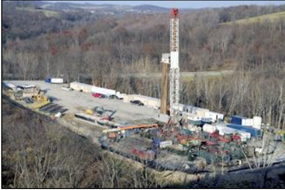
A natural gas drilling rig in Greene County, Pennsylvania.

Excerpt taken from StateImpact Pennsylvania